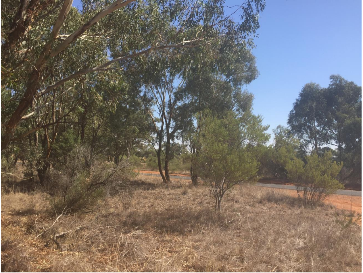
Photograph 4: Roadside vegetation adjoining Old Sydney Road at existing site entrance near transmission lines