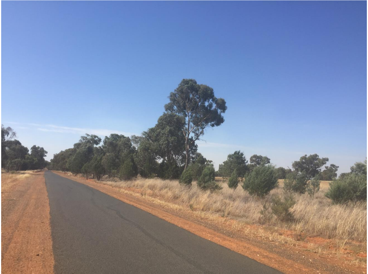
Photograph 6: Old Sydney Road, looking east, adjacent to proposed new site entrance