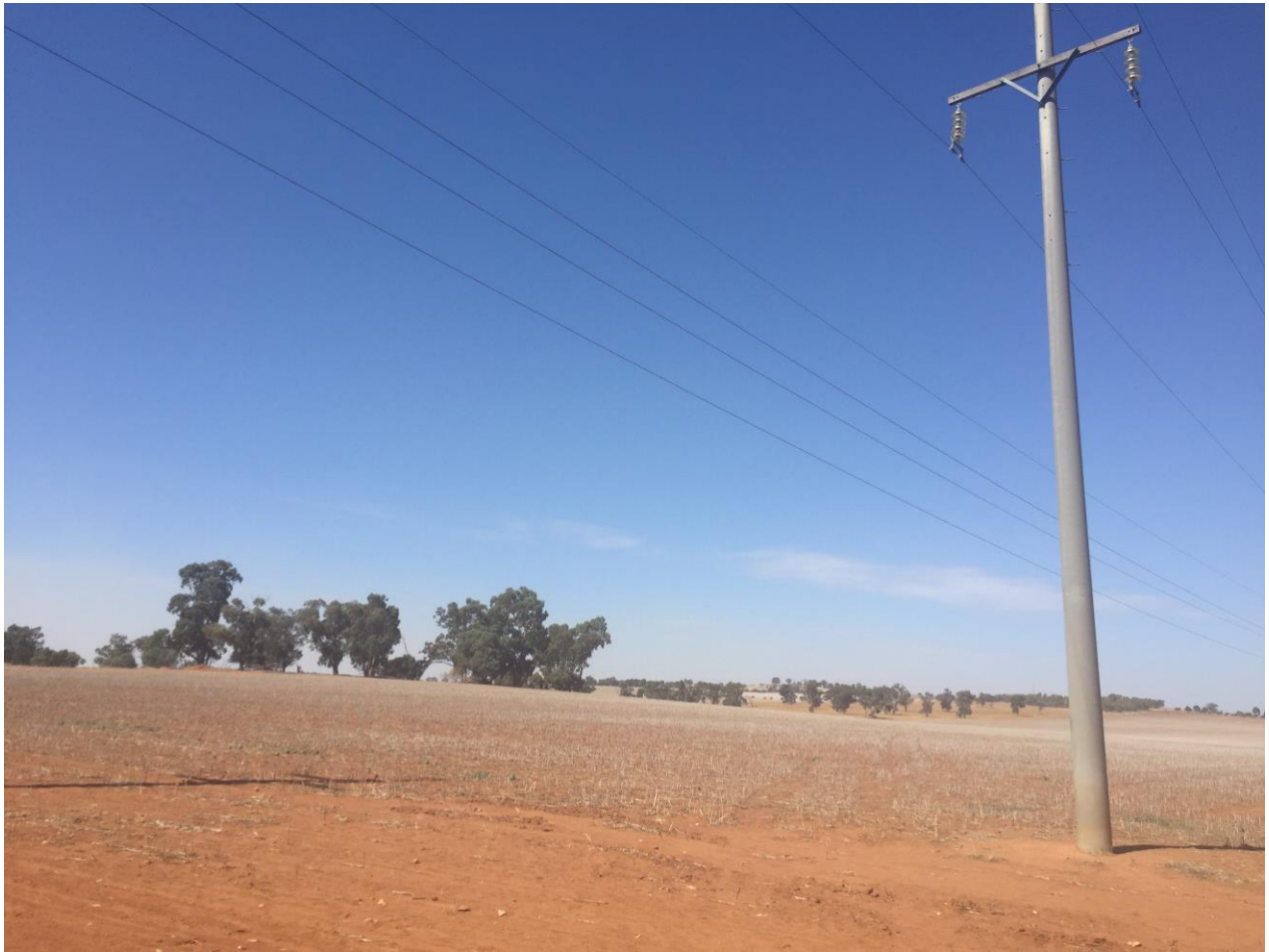
Photograph 1: Subject site, looking south-east, near transmission lines