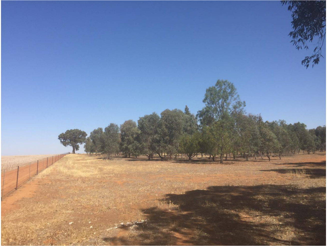
Photograph 9: Retained native vegetation path, looking south