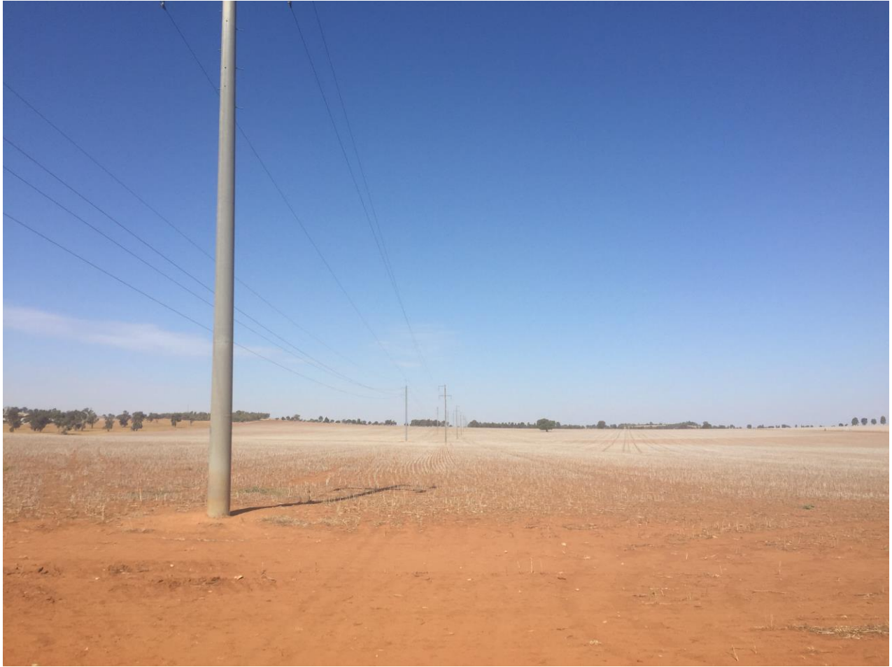
Photograph 2: Subject site, looking south