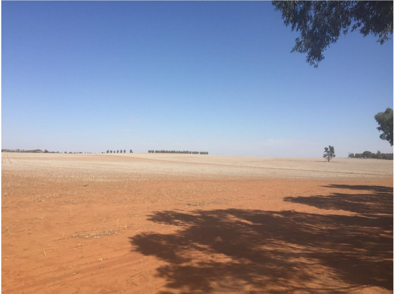
Photograph 3: Subject site, looking south-west, near transmission lines