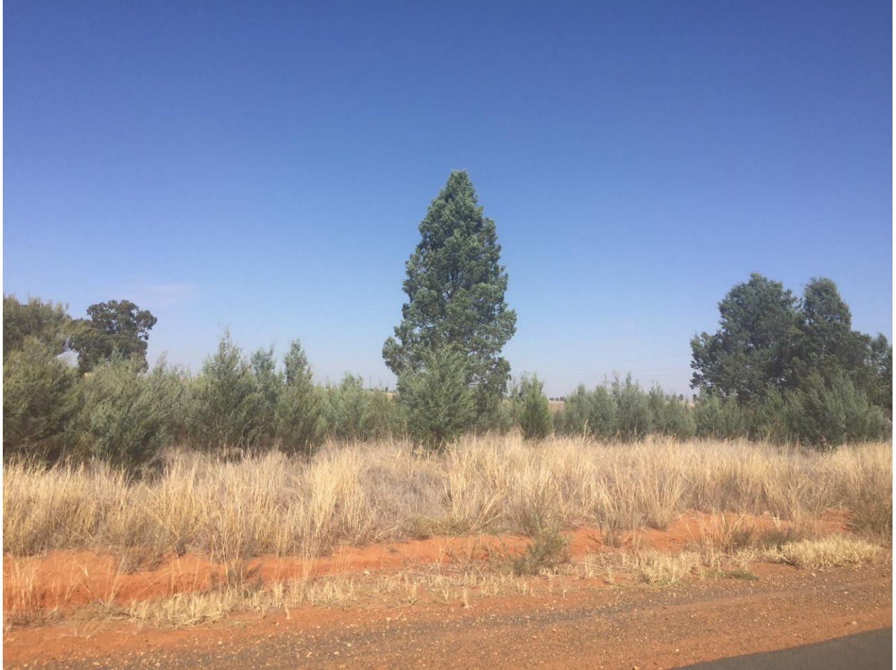
Photograph 5: Roadside vegetation adjoining proposed new site entrance