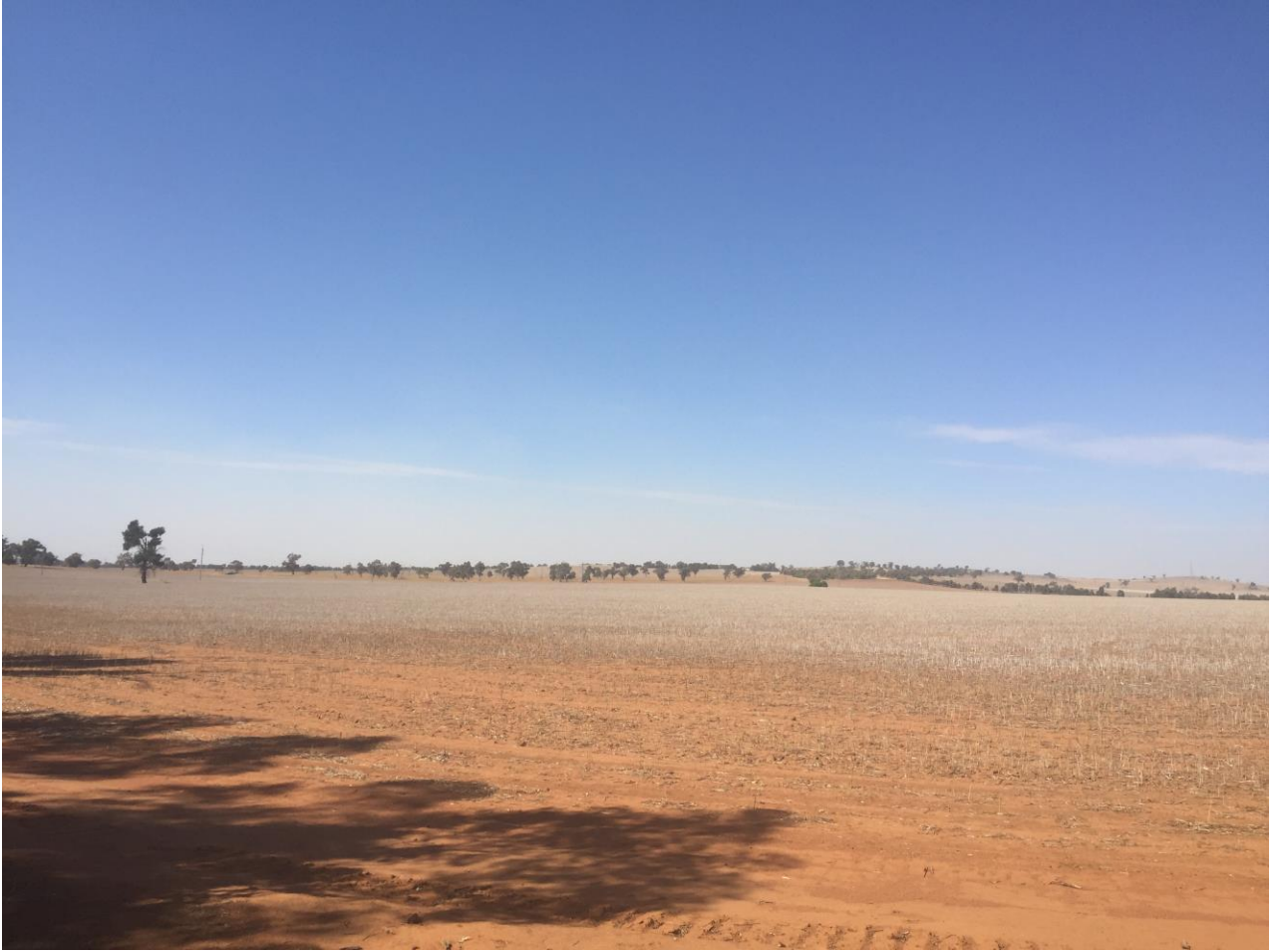
Photograph 8: Subject site, looking east, near retained native vegetation patch