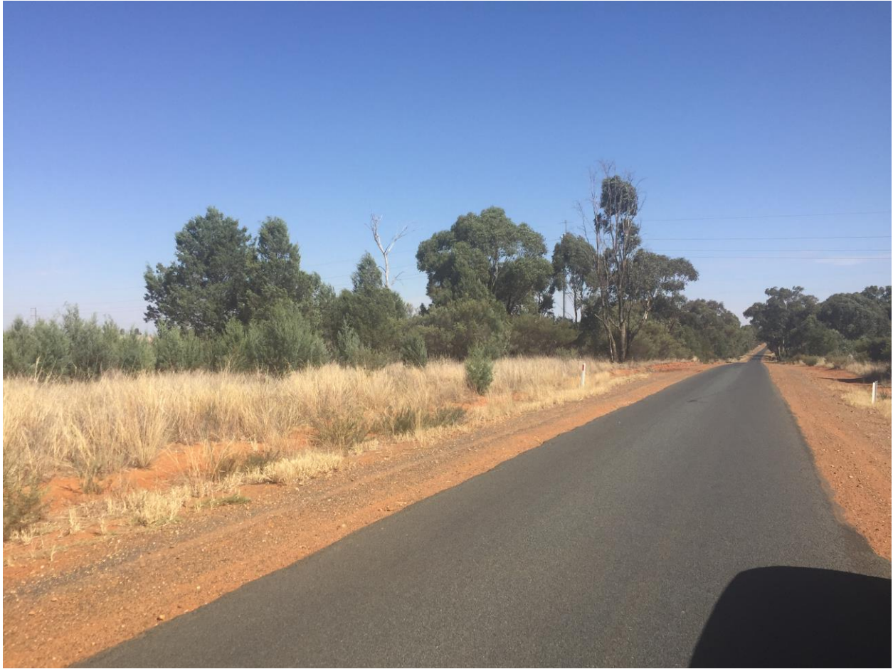
Photograph 7: Old Sydney Road, looking west, adjacent to proposed new site entrance