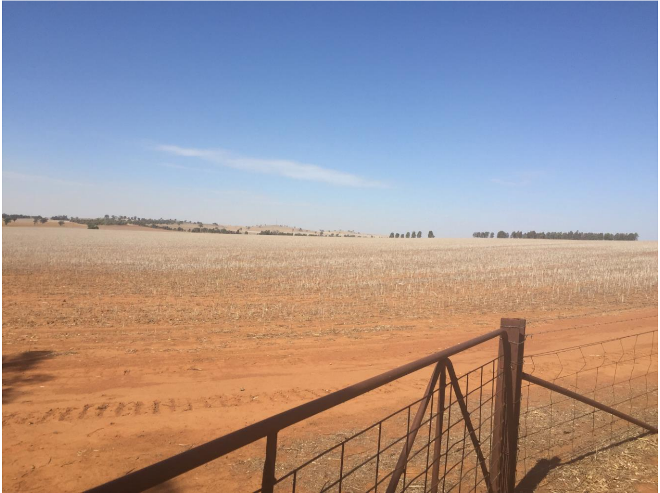
Photograph 10: Subject site, looking south-east, near retained native vegetation patch

Appendix 2 - Copies of written submissions